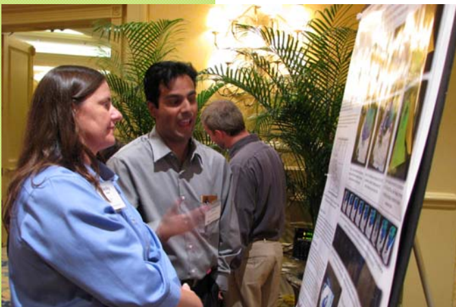
Conference attendees discuss NGI research at this year's gathering in Biloxi.

Save the date for the next NGI Conference, May 20-21, 2009 in Mobile, Alabama. Details will be posted on the web.