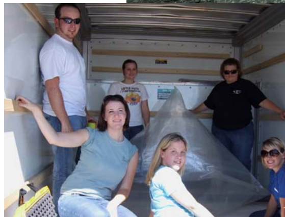
2008 NOAA WISDOM balloon and launch team members