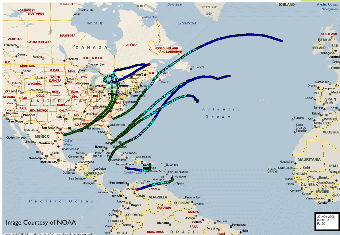
Map Indicates Paths of Launched WISDOM Project Balloons

Visit the web for more information on the WISDOM Weather Balloon project: http://www.NorthernGulfInstitute.org/projects/Visualization/WISDOM .