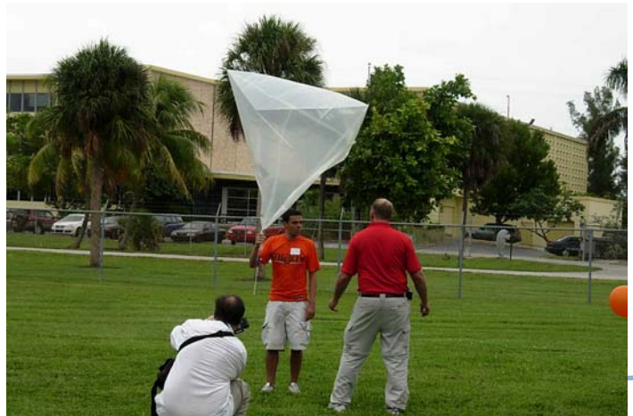
University of Miami students learn to launch weather balloons.

mented in the WISDOM project. The balloons carry a GPS tracking device on them that records the altitude and location, which will help determine the wind speed around a