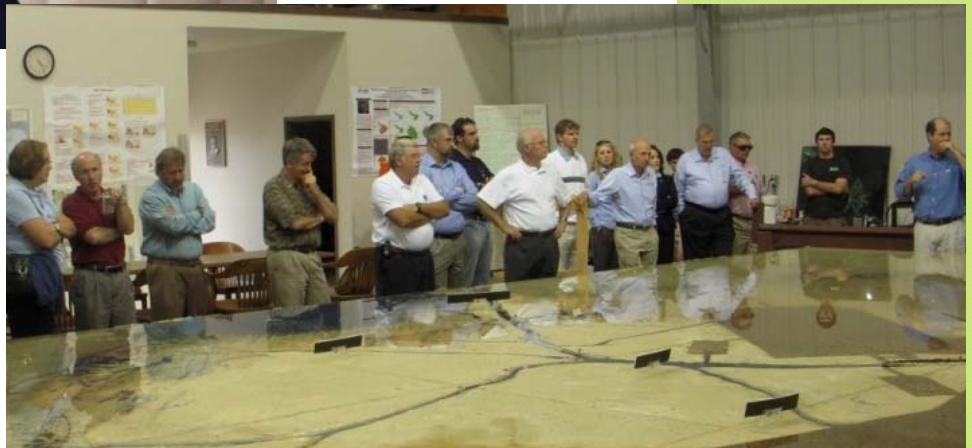
NGI Fellows and Advisory Council toured the Mississippi Delta modeling facility while meeting at LSU.