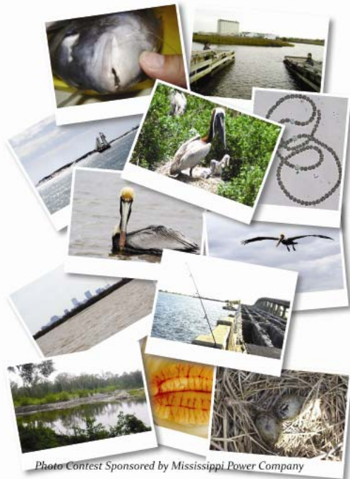
Photo Contest Sponsored by Mississippi Power Company