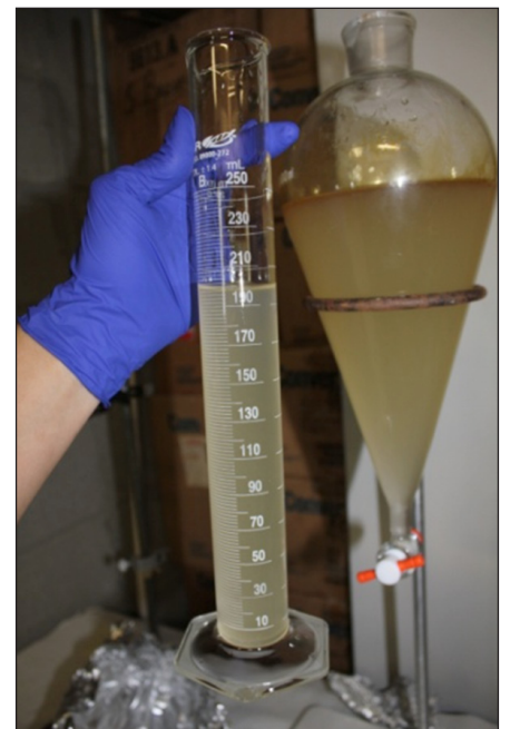
Oil and water mixture used in exposure experiment on larval and juvenile spotted seatrout.

They used a laboratory technique known as qPCR to look for a gene that is expressed by the liver and a known biologic indicator of contaminants. High levels of this gene are an indication that the body is in the process of breaking down toxins. All of the fish that were exposed to oil and dispersant in this study showed signs of this process occurring. The endocrine system which regulates growth, reproduction and development was also evaluated by qPCR. Griffitt looked for changes in proteins expressed by the liver that are associated with the hormone estrogen and egg production. Although it is known that hydrocarbons can disrupt the endocrine system, no disruption was observed in this brief exposure experiment. Griffitt also found that growth was affected in both the larval and juvenile fish by exposure to oil and dispersant. A reduction in growth rate was observed in the oil and dispersant mix treatment and the dispersant alone treatments for the larval fish. While Griffitt's research is limited to a single species of fish, his experiments provide one small window into the potential effects of the oil spill.